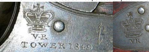
8. P1842 British Sea Service percussion pistol