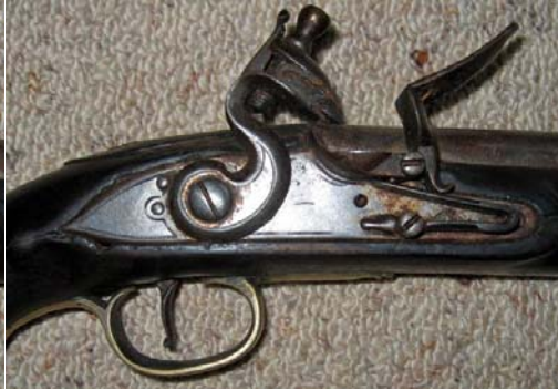
2. P1759 Land Service Flintlock Pistol