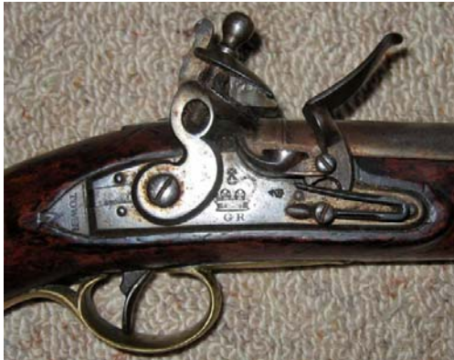
4. P1800 New Land Pattern Flintlock Pistol