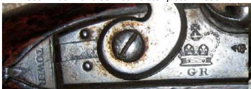
4. P1800 New Land Pattern Flintlock Pistol