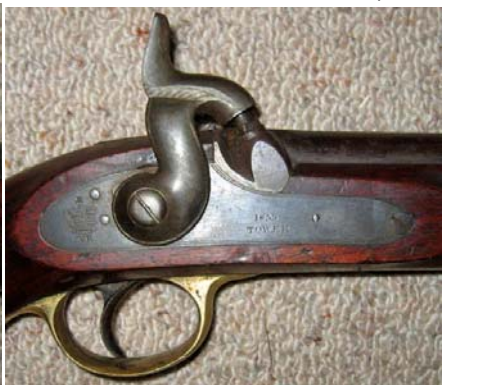
9. P1853 British Land Service percussion rifled pistol