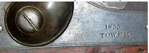
9. P1853 British Land Service percussion rifled pistol

In time I will compile draft NZAR Info Pages on the above pistols for critique / comment.