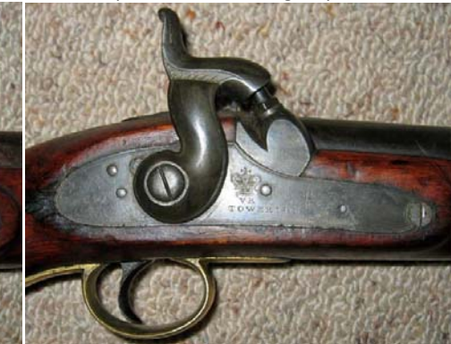
8. P1842 British Sea Service percussion pistol