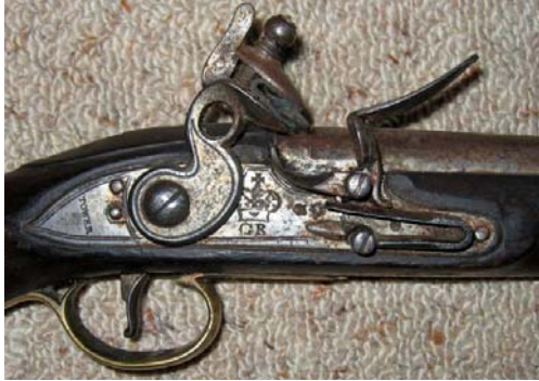
1. P1759 Sea Service Flintlock Pistol.