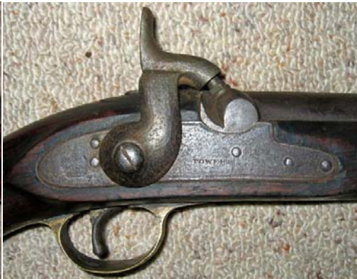
5. P1797/1839 Napoleonic War emergency Pistol