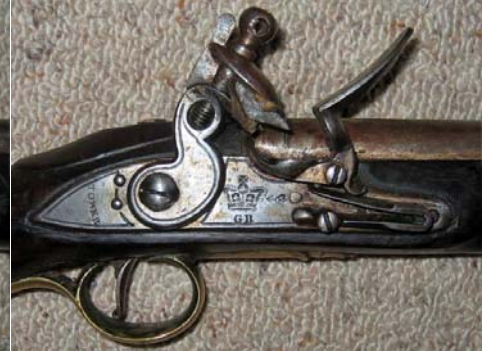
3. P1770 Land Service Flintlock Pistol