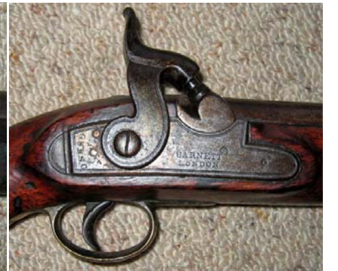
6. P1839 British sea service pistol