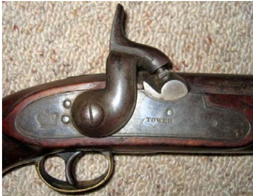
7. P1839 British Land Service holster pistol